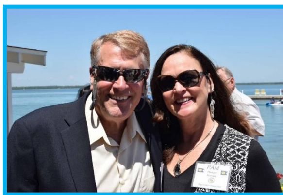
Fun at the Boat House at Gordon Lodge - 6/4/17