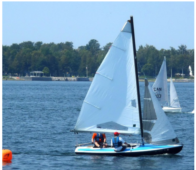
A scene from the 2012 Regatta